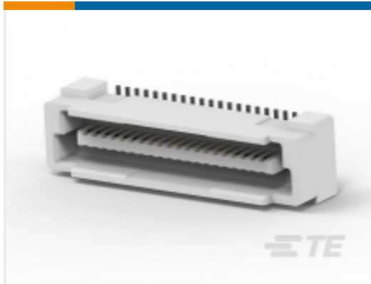
TE Part # CAT-313-PCB40 Free Height Plug Connector: Board-Board, Vertical, 40, 0.8mm