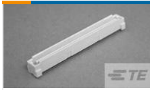
TE Part # 5179029-1 0.8FH,P06H.5,040,08/Sn,TU